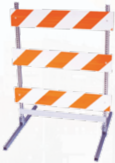
Steel Breakaway Barricade

Tubular Steel Uprights Breakaway Hardware Barricade Plate Plastic Boards