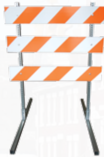
Steel Welded Square Tube

Tubular Steel Uprights Welded Footers Plastic Boards