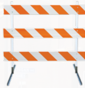
Steel Welded Angle

Steel Angle Uprights Welded Angle Footers Barricade Plate Plastic Boards