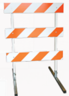
Steel and Plastic Barricade

Tubular Plastic Uprights Welded Footers Plastic Boards